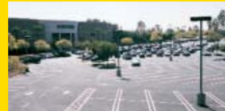
Pipe Pull™ can replace damaged pipe under parking lots with little or no surface excavation.