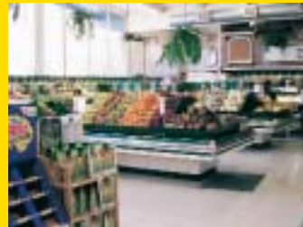
Pipe Pull™ can greatly reduce costs, business disruptions and the need for equipment removal in retail areas.