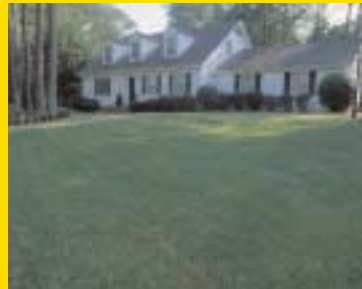
The Pipe Pull™ method can preserve your beautiful lawns, driveways and other landscaping items.

The Pipe Pull™ method avoids the expensive replacement costs of landscaping, driveway and parking lot surfaces, not to mention interruptions to your business or other operations that can make even a small project become an expensive nightmare.